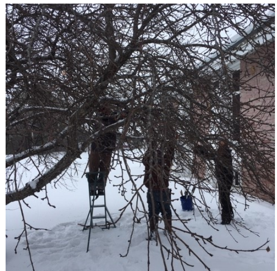
Fruit Tree Pruning Demonstration