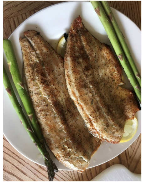
Fish cooked by 6th grade student JKL Bahweting School

Two online lessons were created for JKL Bahweting School's 6th grade classes . These lessons were modeled based on our in-person Boat 2 School program. Lesson One was an "Eat A Fish" cooking demonstration, the second lesson was interactive walleye ecology and dissection. In addition, a virtual tour of the Sault Tribe Walleye Hatchery was prepared, but not finalized. Footage taken by the Sault Tribe will be used to finalize an online program for 2021. Sixty participants were reached.